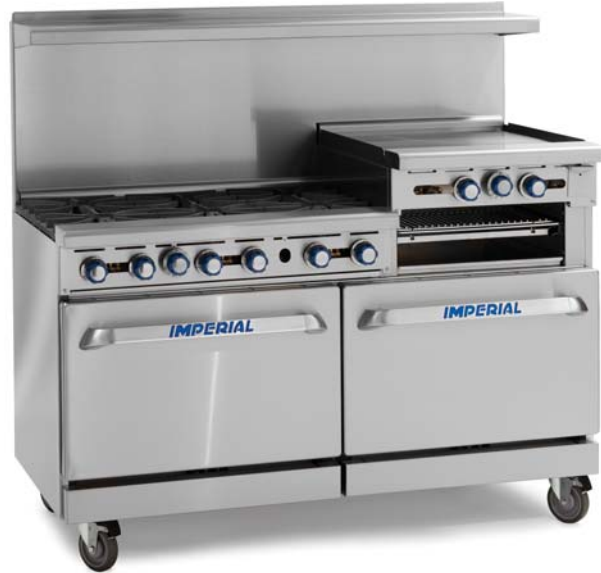
IR-6-RG24 shown with optional casters

OPEN BURNERS - PyroCentric™ 32,000 BTU (9 KW) anti-clogging burner with a 7,000 BTU/hr. (2 KW) low simmer feature. Two rings of flame for even heating.