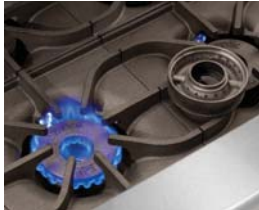
Two rings of flame for even cooking no matter the pan size.