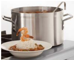
Large 5" (127 mm) stainless steel landing ledge for convenient plating.