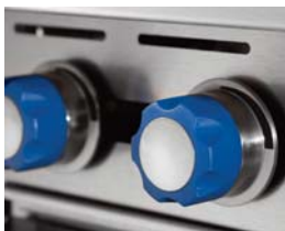
Durable cast aluminum with a vylox heat protection grip.