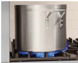
Back grate hot air dam deflects heat onto the stock pot, not the backsplash.